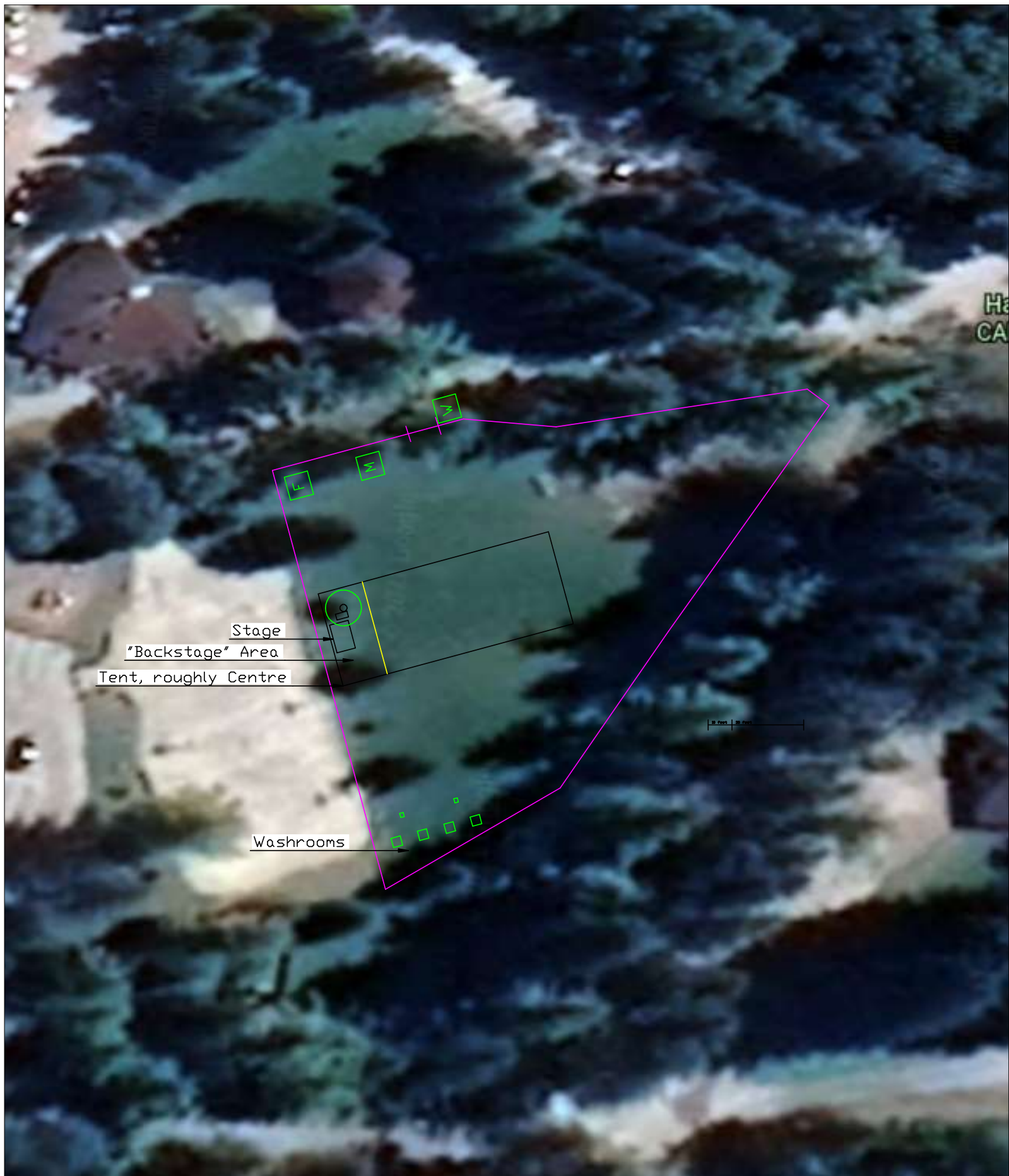
Venue 04 - Harrison Park "Field" Scale: Not To Scale