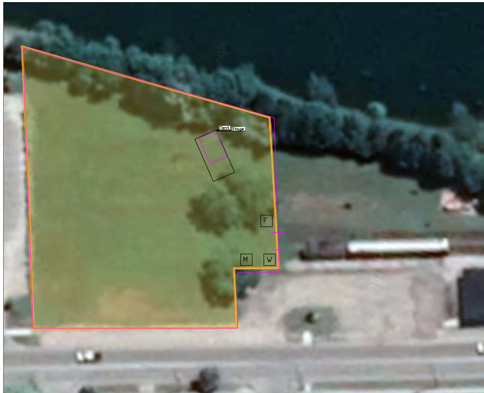
Venue 07 - Rail Museum Scale : UNK