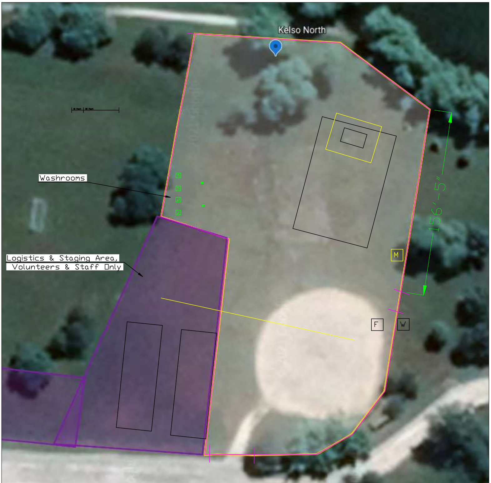
VENUE 2 - Kelso North Scale : Not To Scale