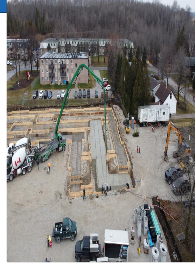
Planning Applications Received