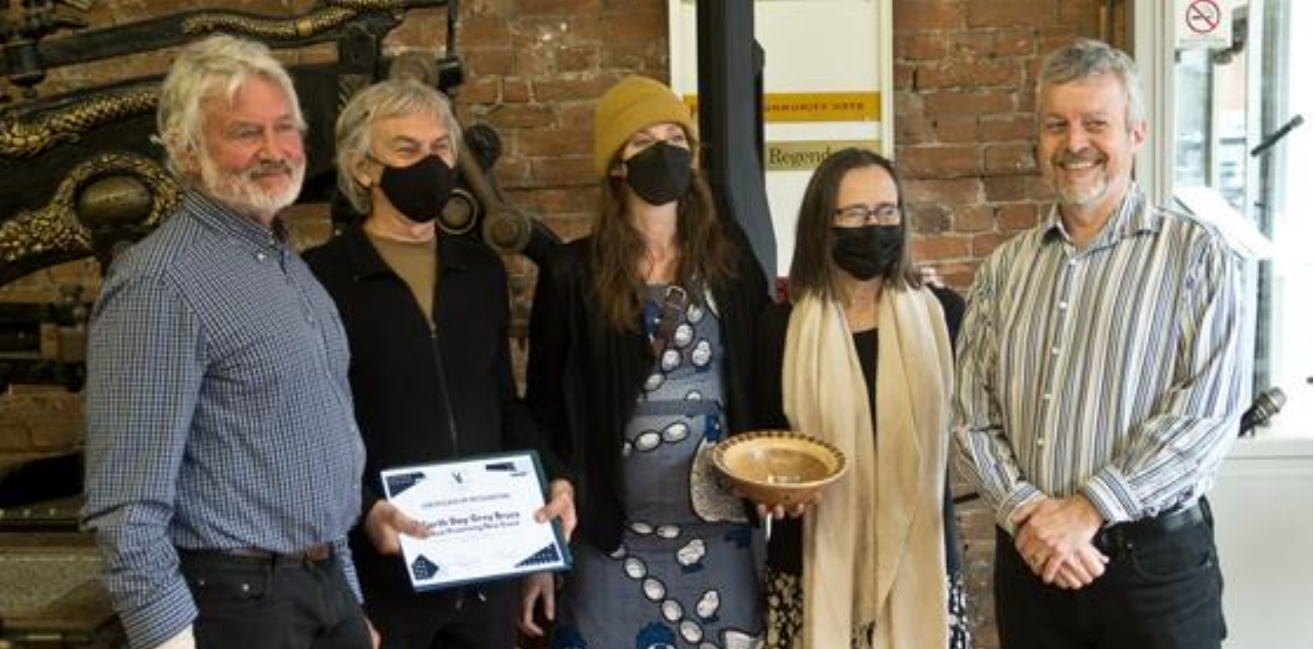
City of Owen Sound Most Promising New Event Award