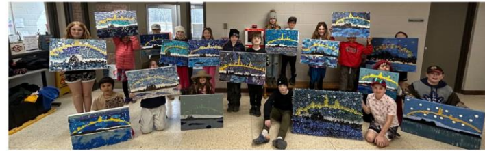
Image Credit: Students from Keppel Sarawak Elementary School standing proudly with their Upcycling TOM class creations, March 2024.

SPECIAL SHOWCASE & ACTIVITIES ON EARTH DAY @ TOM APRIL 20, 12-2PM