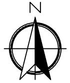
Figure 1: Proposed Lot Line Adjustment