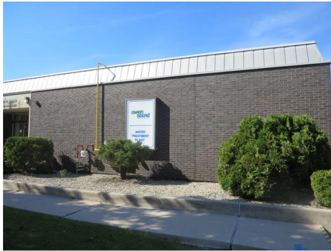
Richard H. Neath Water Treatment Plant